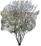
Shadblow- Multi Stem